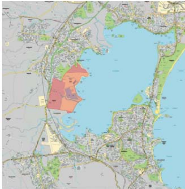
Figure 1 – Site context

The site is significant from both a local and regional perspective due to its location and considerable land holding in single ownership close to infrastructure facilities on the foreshores of Lake Illawarra.